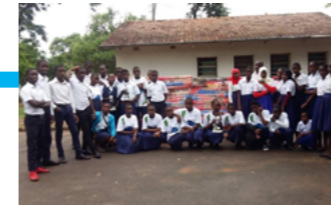
Fund-raising efforts provides mattresses for our partner school in Malawi