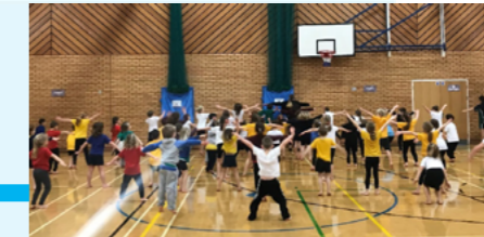
PE students lead a range of activities for primary schools