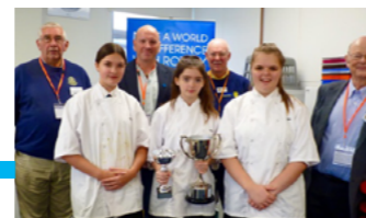
Dawlish students taste success in both rounds of The Young Chef competition