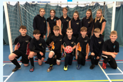
Success in Futsal and Netball before tournaments are cancelled