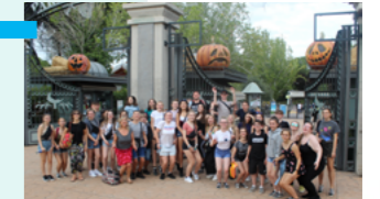
An early start for PE students to Metropolitan University, Cardiff to explore careers in PE