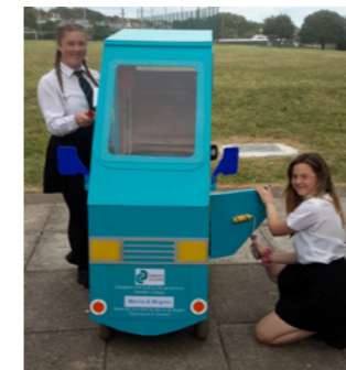
DT students create a motorbility and recycle truck!