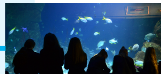
Year 7 students visit The Aquarium as part of their Natural Form coursework while Year 10 head to galleries in Bristol.