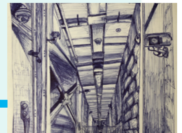
Even in lockdown, students continue to produce amazing work!