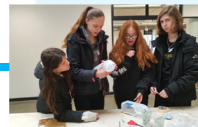
Girls from Years 9 and 10 participate in Women In Industry days as well as exploring careers in the NHS