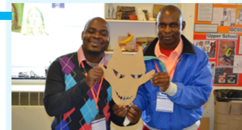
Our first Africa week kicks off with a visit from teachers of our partner school in Malawi