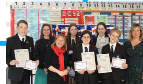
MFL students participate in the regional speaking competition - delivering presentations in French and Spanish