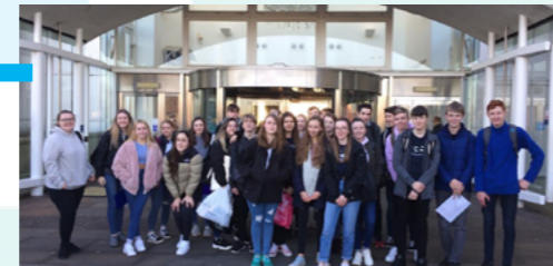
The Geography Department complete field studies in Bristol and Dawlish