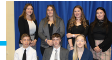
Year 11 get smart for their mock interviews in preparation for college applications