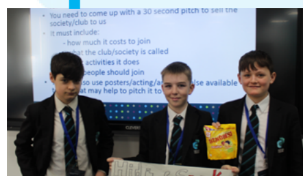
A visit to Marjon University as part of the Aim High programme