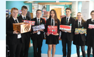
70 shoe boxes packed with essentials and treats set off for Moldova