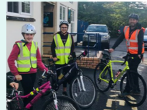
Bikeability arrives at Dawlish College. Students learn cycle maintenance and road safety

Teign Hockey Club provide coaching sessions to lower school students