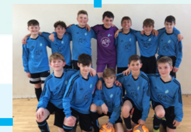
The Year 8 boys' Football Team take on Cuthbert Mayne and leave with a 7-1 victory