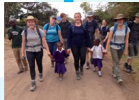
Students return from 4 week Tanzania experience

Teign Hockey Club provide coaching sessions to lower school students