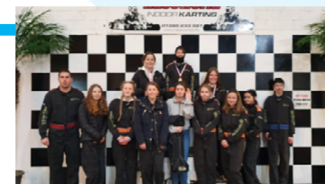
Year 9 and 10 burn rubber at Raceworld in recognition of their hard work.