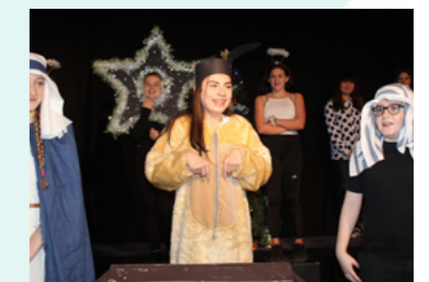
A cracking evening's entertainment by The Performing Arts faculty