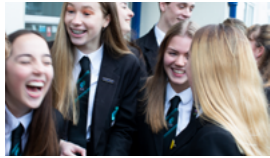
Best ever GCSE results celebrated in style