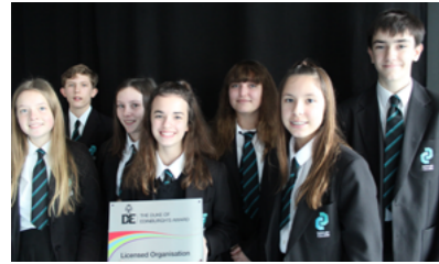
Dawlish College becomes a licenced centre for the D of E award, enrolling its first students